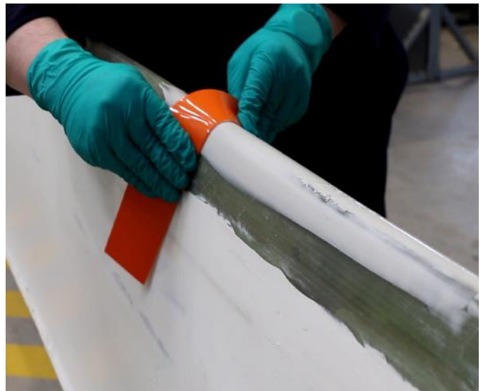
Easy to contour leading edge, no need for sanding.

For more information, please contact your local Belzona representative: