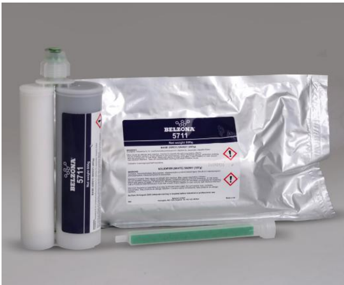
Belzona 5711 supplied in cartridge with static mixer.