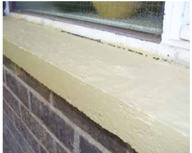
Belzona 5151 used on window sills and lintels