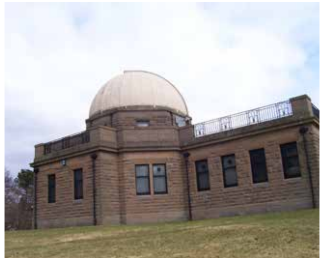
Belzona 5151 provides an aesthetically pleasing finish

For more information, please contact your local Belzona representative: